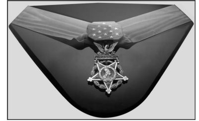
An Army Medal of Honor

When a handful of concerned citizens in Colorado learned that some people were wearing fake military medals they'd never earned, they decided to do something about it. They went to their Congressional representative and made a suggestion. They wanted him to introduce a bill in Congress making it illegal to lie about military medals. After learning more about the problem, the representative agreed.